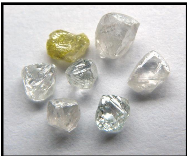
A sample of diamonds recovered from the Kahuna Project